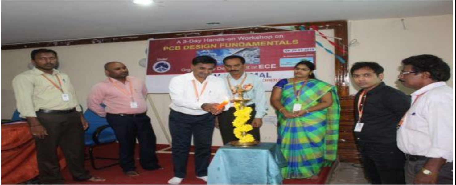
The indispensable and pervasive knowledge of electronic circuits will give the students an insight to their practical approach and also evokes innovative thinking.